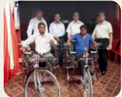
Mobility aids like wheelchairs, tri-cycles, walkers, crutches

All devices are custom-made and fitted by trained prosthetists for optimal comfort and use.